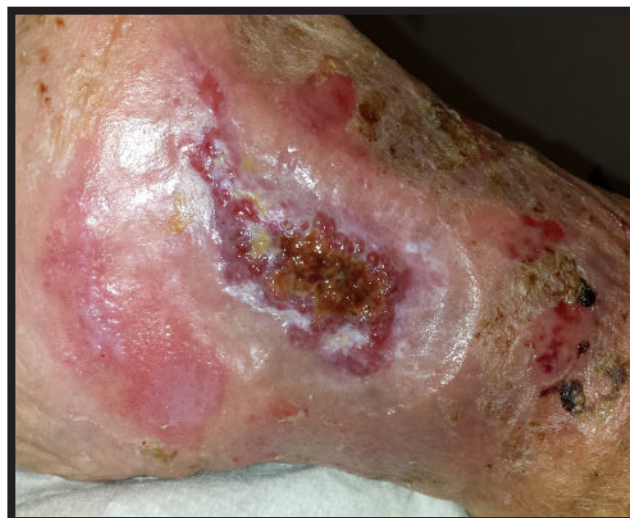
Day 29 of CDO