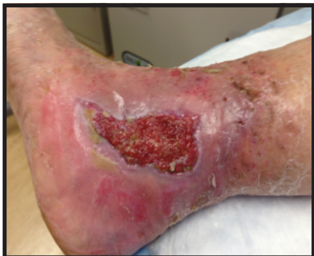
Day 0 - Initiation of CDO Measurement: 6.7 x 5.3 with hypergranulation