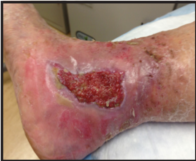
Day 0 - Initiation of CDO Measurement: 6.7 x 5.3 with hypergranulation