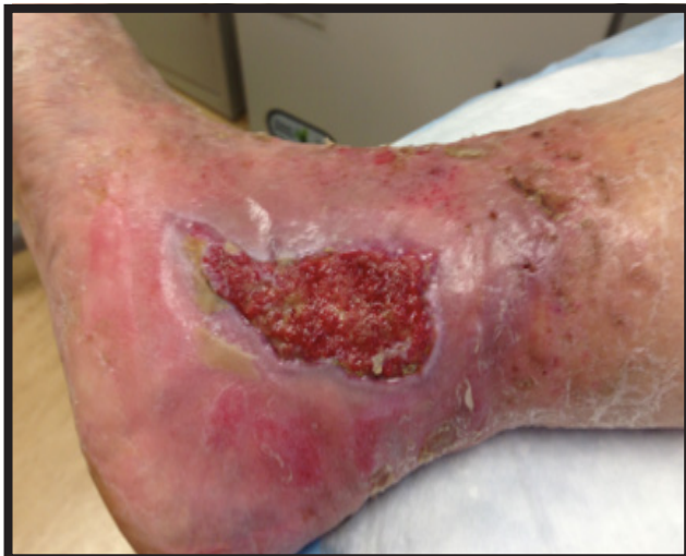
Measurement: 6.7 x 5.3 with hypergranulation