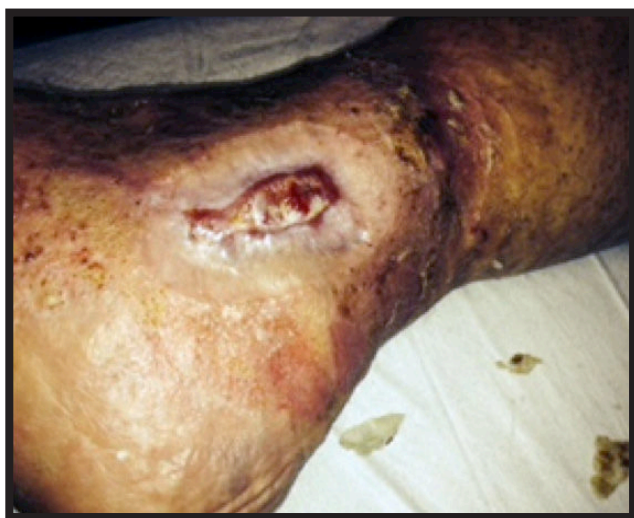
Day 54 of CDO Measurement: 3.6 x 1.3 with hypergranulation