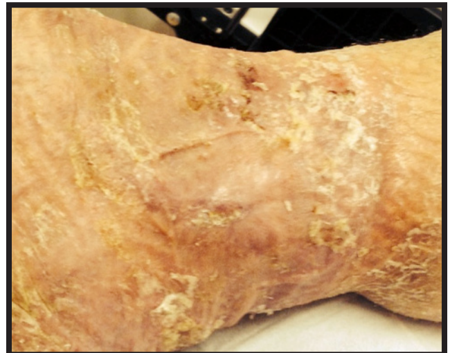
Epithelialization over hypergranulation