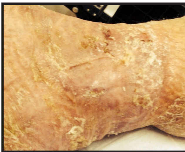
Day 79 of CDO - Wound Closed Epithelialization over hypergranulation

Published in Podiatry Today November 2014